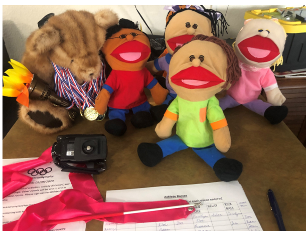
Judges of Brooks-Howell Olympics