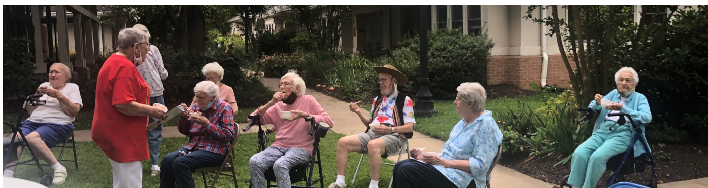
Ice Cream Social